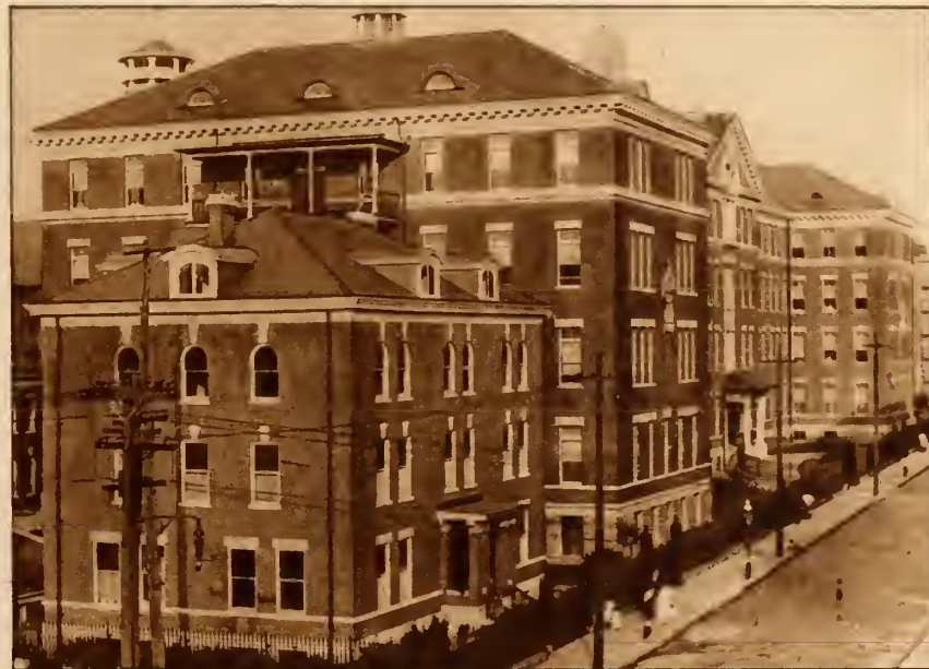
ST. FRANCIS HOSPITAL, Brook Avenue and 142nd Street.